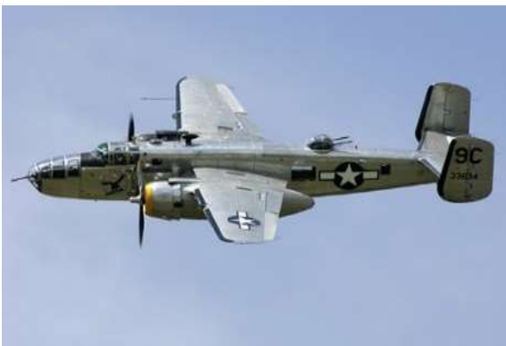
B-25 "Yankee Warrior" - Flyable

The B-25 Mitchell is an American twin-engine, medium bomber manufactured by North American Aviation. The plane was named in honor of Major General William "Billy" Mitchell, a pioneer of U.S. military aviation. Used by many Allied air forces, the B-25 served in every theater of World War II and after the war ended many remained in service, operating across four decades. Produced in numerous variants, nearly 10,000 Mitchells rolled from NAA factories. These included a few limited models, such as the United States Marine Corps' PBJ-1 patrol bomber and the United States Army Air Forces' F-10 reconnaissance aircraft and AT-24 trainers.